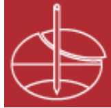
International Society for Soil Mechanics and Geotechnical Engineering