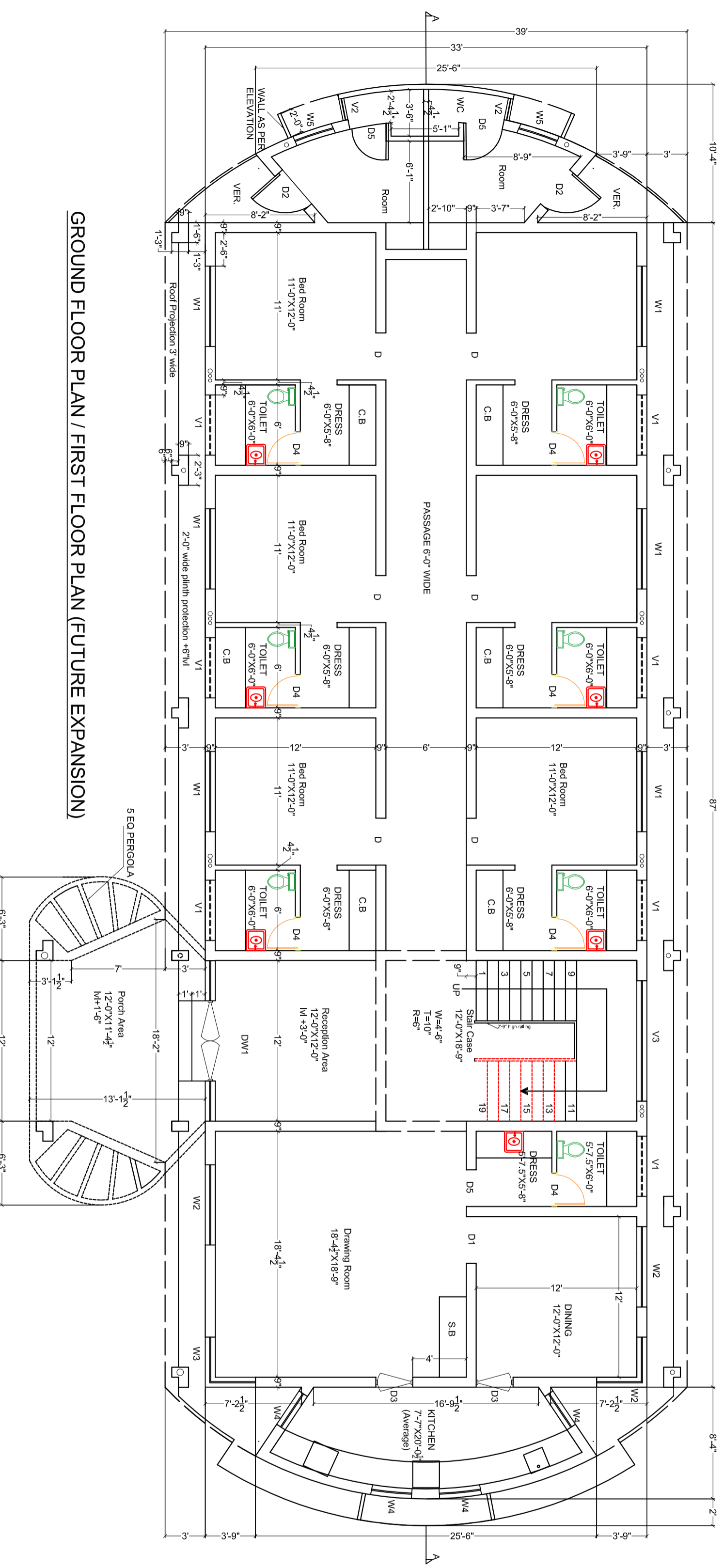
GROUND FLOOR PLAN / FIRST FLOOR PLAN (FUTURE EXPANSION)